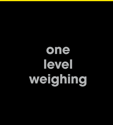
one level weighing