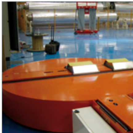
1-level revolving table