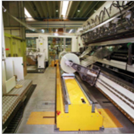
slitter shuttle + 1-level lift