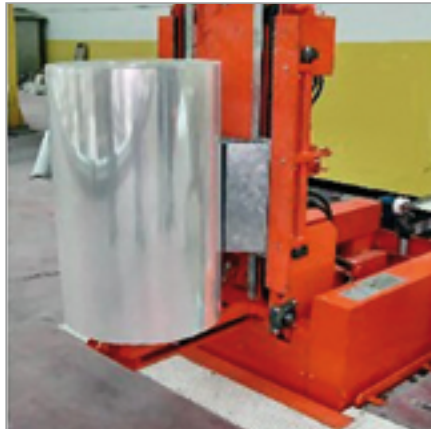
1-level lift tipper