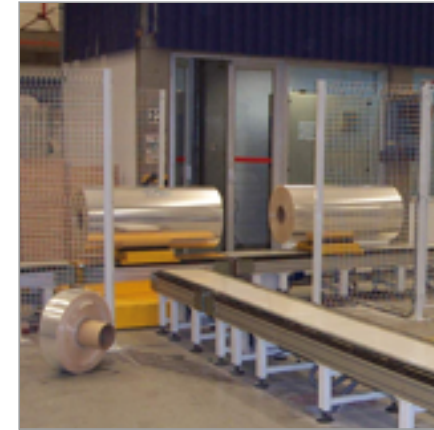
straight 1-level conveyor